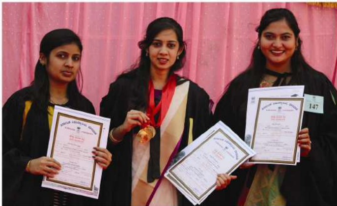
Our Proud Academic Achievers - 2019