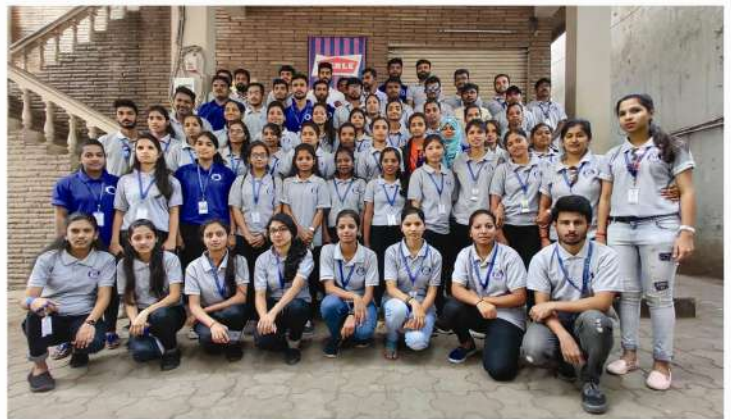
Industrial Visit - Hyderabad