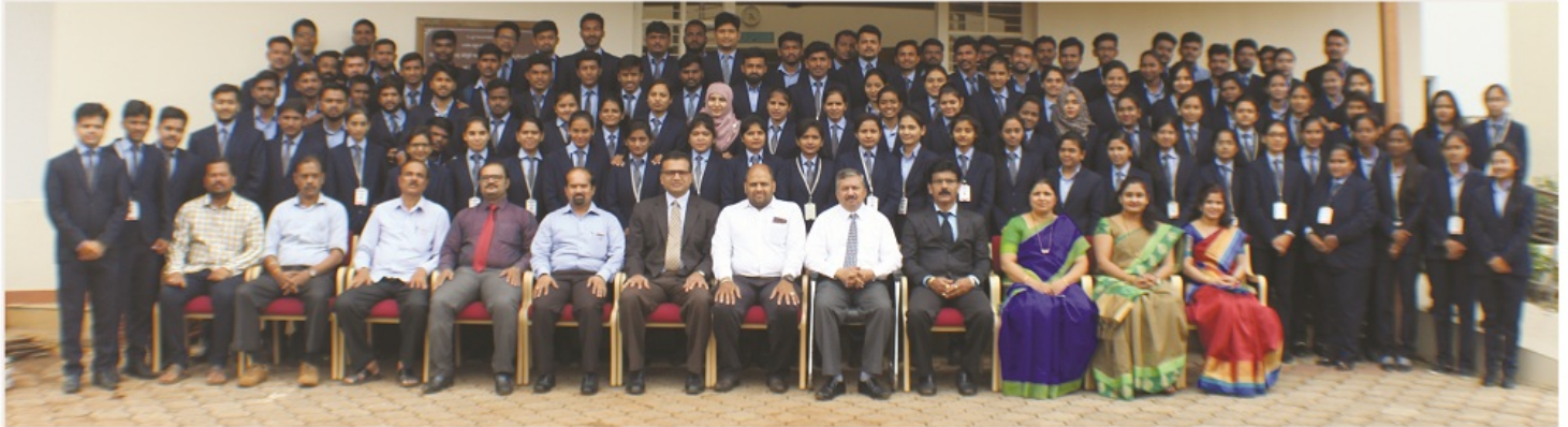
Beginning of a New Era – From Campus to Corporate: Batch 2017-19